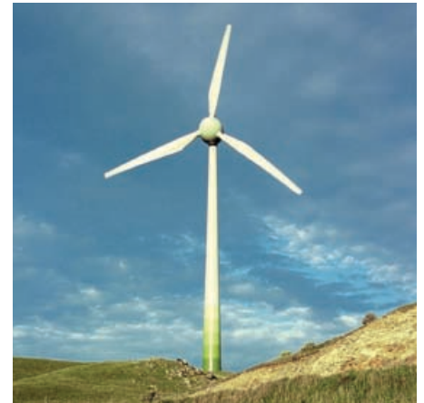
Genesis Energy's existing Hau Nui wind farm.